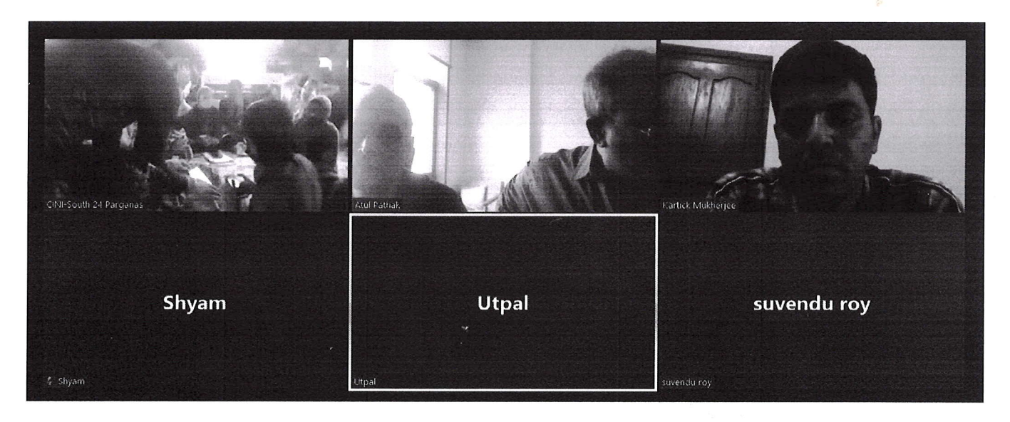
Figure 1: Video interviews with the IIMPACT team members

The impact of the program interventions is seen on various dimensions. These include (1) Improved educational inputs; (2) Increased interest in education; (3) Performance in education; (4) Greater ambition and dreams; (5) Value system; (6) Positive attitude and habits; and (7) Girl-child's perception of changes in parental attitude. These impacts are described in detail below.